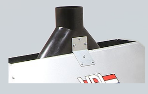
Feed distribution set for 180 L hoppers, to optimize the feed distribution in the hopper.